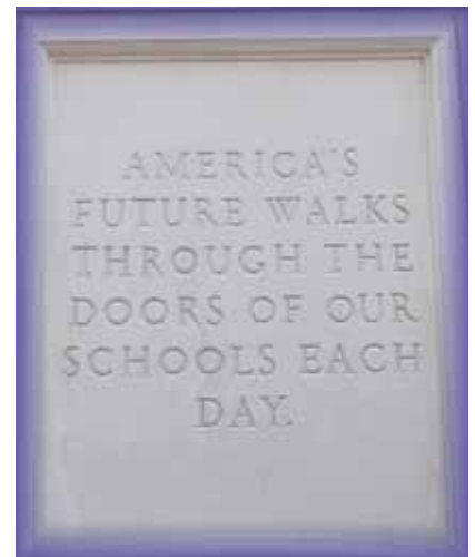
New inscription above entrance to Harding Elementary School

Before the renovations students needed to cross the street to school when being dropped off by their parents. As a result of the new parking lot design, a student drop off "turning lane" will provide a much safer arrival. Another priority for school safety was designing the main entrance with a security system using visual monitoring and double vestibule doors with a "buzz in" feature. When completed, the school will also be entirely handicap accessible via a new elevator, have a new entrance, an infill addition, and upgraded mechanical, electrical and plumbing systems.