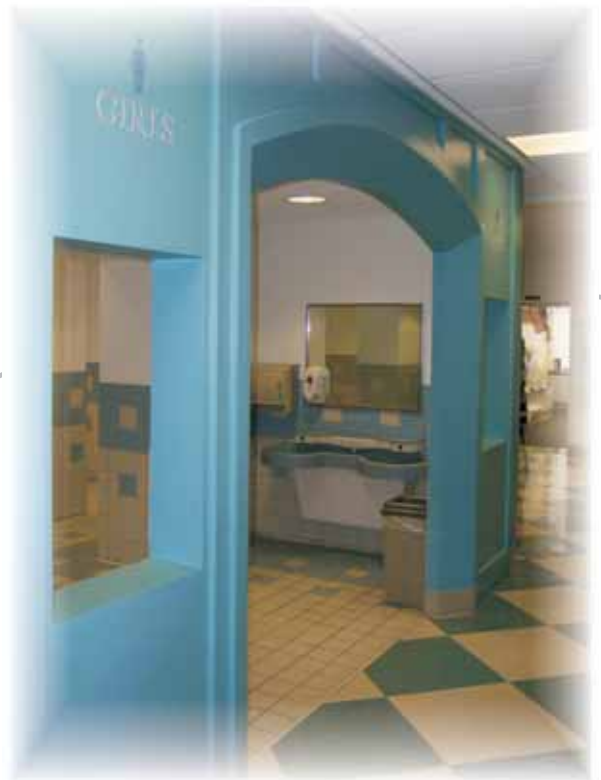
Renovated girl's restroom with handwash area in full view allowing for greater teacher supervision