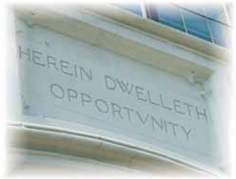
One of several inscriptions on the exterior of Harding Elementary School

This project is scheduled for completion in August 2008. Lobar, Inc. of Dillsburg as the general contractor and Fairchild Services of Reading as the construction manager round out the team in allowing "these walls to talk" for many years to come!