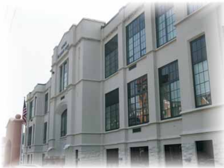
Chestnut Street facade