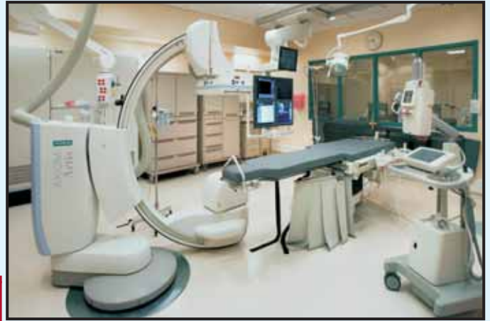
Cath Lab Procedure Room at Ephrata Community Hospital

A. Bob Graupensperger: Outpatient surgery is certainly increasing more rapidly than inpatient surgery. Since 2000 our inpatient surgical volumes have increased by 17% and outpatient surgical volumes have increased by 43%. The shift from inpatient to outpatient is based on technology capabilities and new procedures. Since 1998 we've added seven surgical suites dedicated specifically to outpatient services.