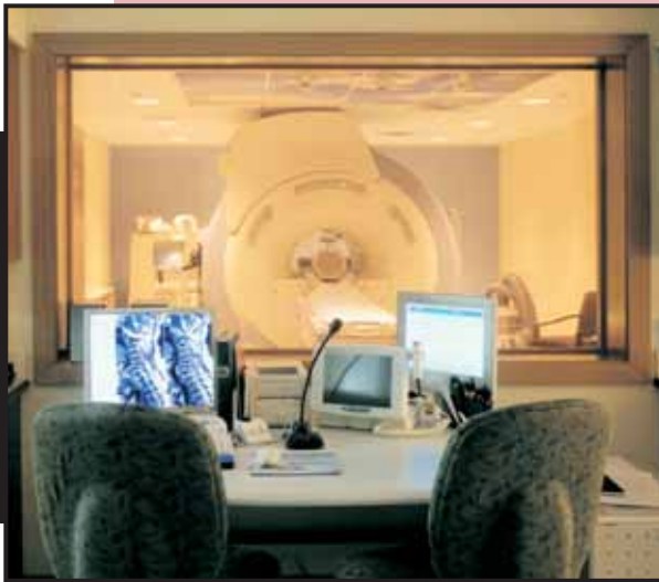
Control Room Looking into MRI Station at Good Samaritan Hospital