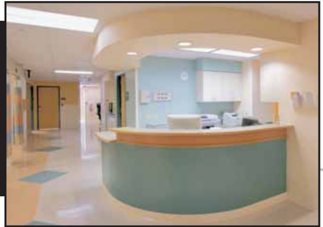
Cath Lab Nurses Station at Ephrata Community Hospital