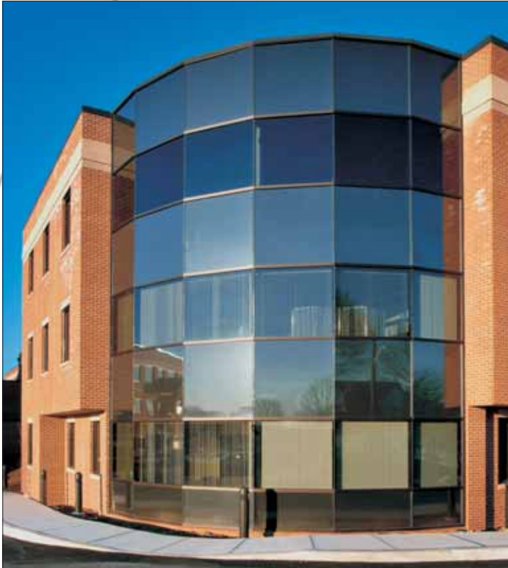
Addition to the 1948 Building at Ephrata Community Hospital for New Pharmacy and Medical Records Department