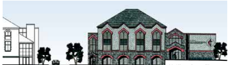
McAllister Street Elevation