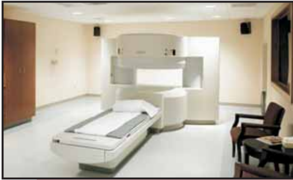
MRI Room at Good Samaritan Hospital