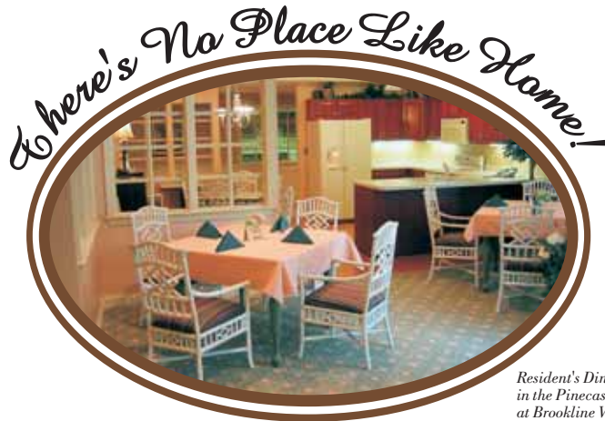
Resident's Dining Area in the Pinecastle Facility at Brookline Village