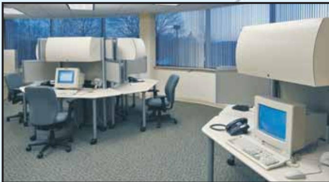
Pharmacy Work Area at Ephrata Community Hospital

Q. Are you finding certain medical specialties are more in demand than others (such as orthopedic, neonatal, etc.)?