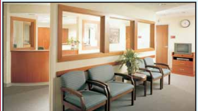
MRI Waiting Room at Good Samaritan Hospital