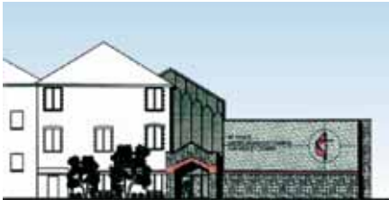
Calder Alley Elevation