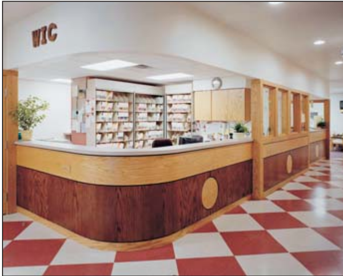
First Floor Reception Area