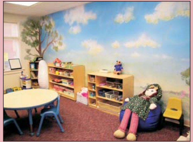
Children's Play Therapy Room in the SARCC Offices

supplemental coupons that are redeemed at grocery stores for foods that meet particular nutritional guidelines set up by the U. S. government. A portion of the building's second floor is shared by SARCC (Sexual Assault Resource & Counseling Center). These two agencies work hand-in-hand to meet the physical and emotional needs of families throughout Lebanon County.